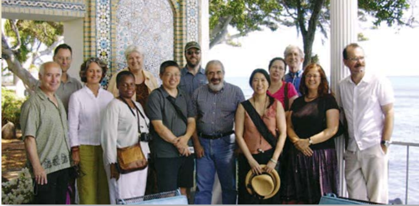
Asian Studies Development Program seminar participants at the Doris Duke Foundation for Islamic Art's Shangri La estate in Honolulu.

Traditions and Modernity: Performing Arts and Cultural Representation — This three-week China field seminar, funded by the Freeman Foundation and the Chinese Ministry of Education, brought 14 American and two Malaysian professors to Beijing, Xi'an, Urumqi and Shanghai, to explore Chinese history, contemporary issues, and diverse cultural practices. This seminar, co-hosted with Beijing University, is part of a series aimed at improving how Chinese and American faculty teach about each other's cultural traditions and social issues.