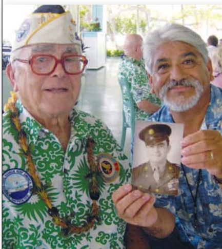
A Pearl Harbor survivor participated in the NEH-funded AsiaPacificEd workshop.